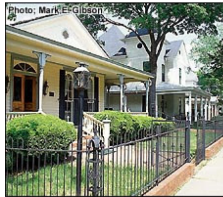
The Historic Oakwood District is the only intact 19th-century neighborhood in the city.

All the morning's activity deserves a good lunch. Try Cafe Carolina for sandwiches and salads and Caffé Luna, featuring light Italian fare in a contemporary setting.